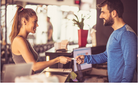
Customer Service Representative